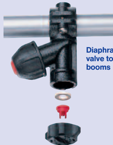
Diaphragm check valve to fit wet booms