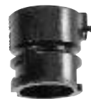
Ball check valve 60 mesh 065.265.56.00 25 mesh 065.266.56.00