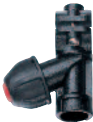
Diaphragm check valve with eyelet connector for 3/4" pipes 065.272.56.KL for 1/2" pipes 065.272.56.KH