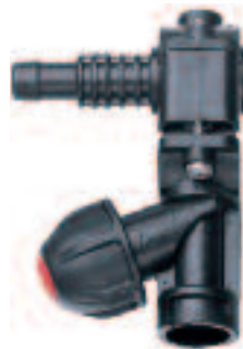
Single-hose connector for 3/4" boom tubings (25-28 mm O.D.) 065.274.56.KL for 1/2" boom tubings (20-22 mm O.D.) 065.274.56.KH