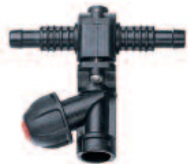
Two-hose connector for 3/4" boom tubings (25-28 mm O.D.) 065.275.56.KL for 1/2" boom tubings (20-22 mm O.D.) 065.275.56.KH