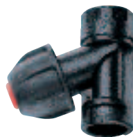
Diaphragm check valve for threaded connection M 18 x 1.5 065.272.56.HB